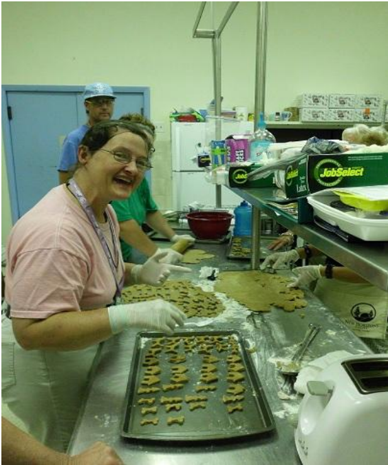
Baking our home-made dog biscuits