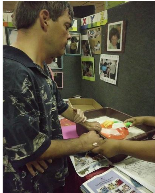
Excavating dinosaur bones