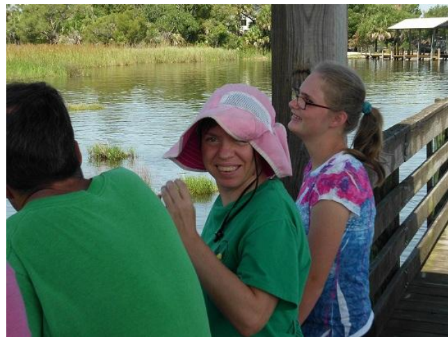
Picnics at the beach